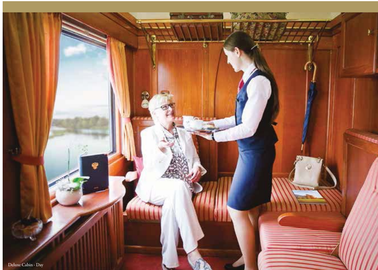
Deluxe Cabin - Day

Travel in some of the finest rail accommodation available in Europe.