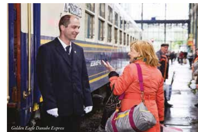
Golden Eagle Danube Express

Our full booking conditions can be found at www.gettrains.com