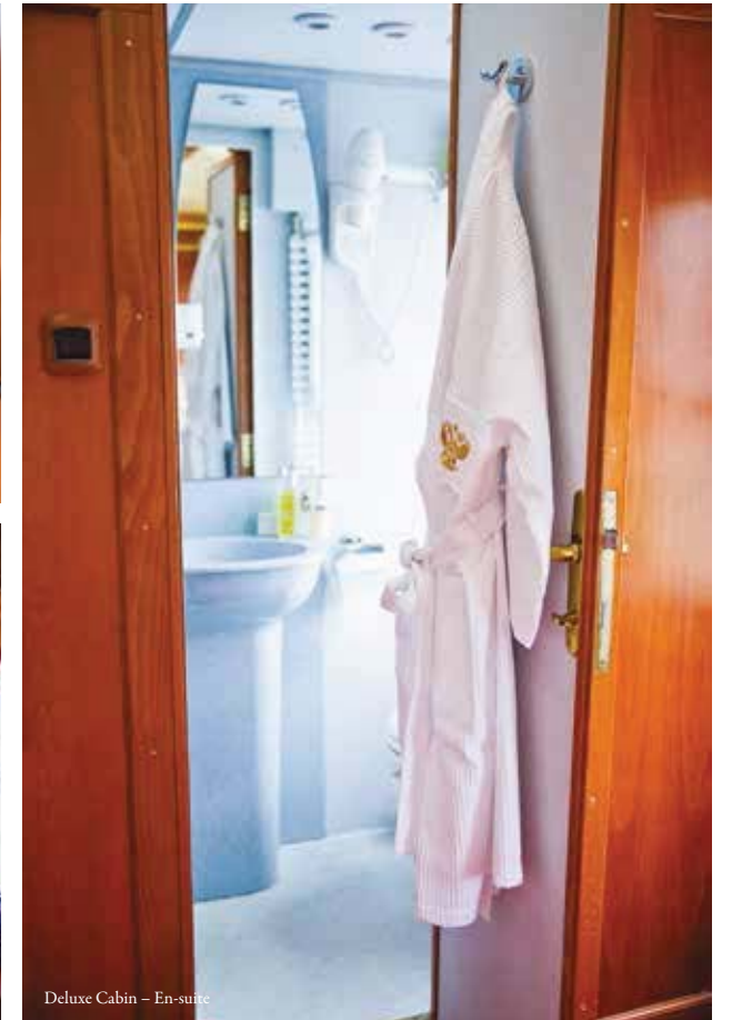
Deluxe Cabin - En-suite