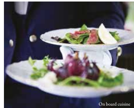
On board cuisine