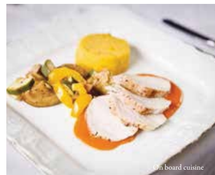
On board cuisine