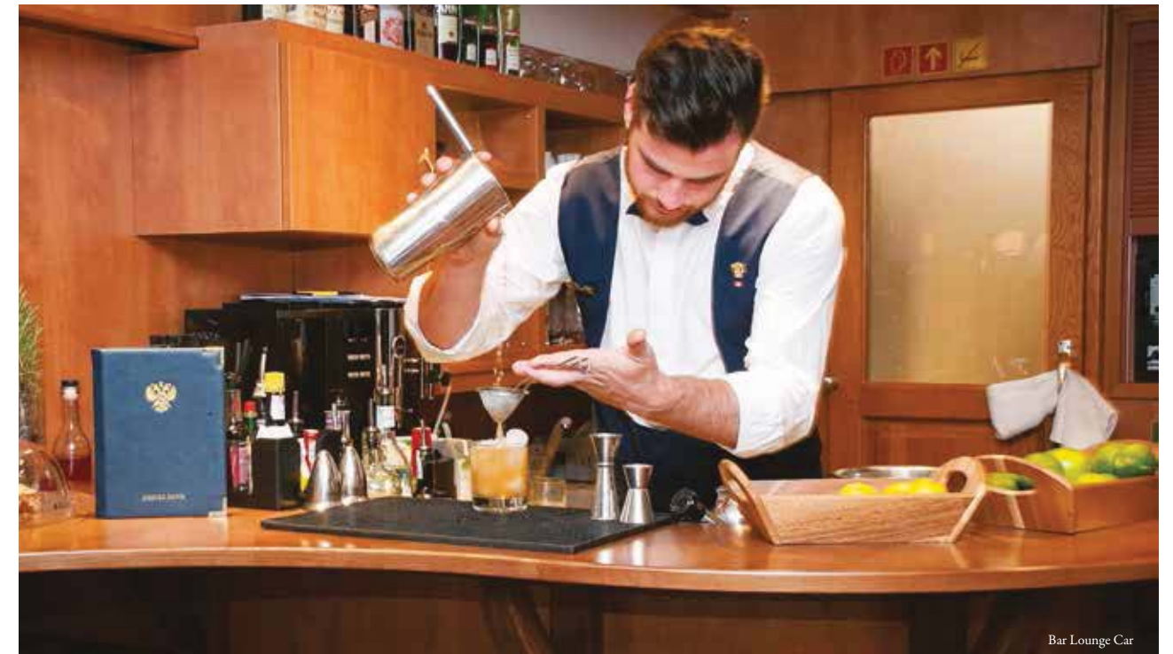
Bar Lounge Car

The social heart of the Golden Eagle Danube Express is the Bar Lounge Car, a great place to relax and settle into the unhurried pace of life on board.