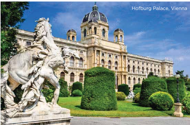
Hofburg Palace, Vienna