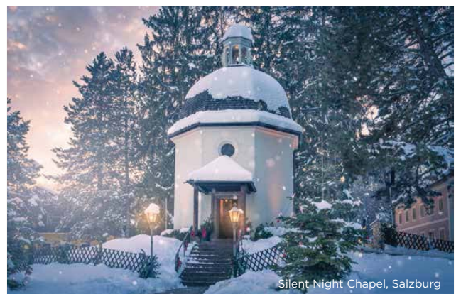
Silent Night Chapel, Salzburg

We return to the train for lunch and from the Restaurant Cars enjoy the spectacular Bavarian scenery as we head across the border into Germany for our final stop in Munich.