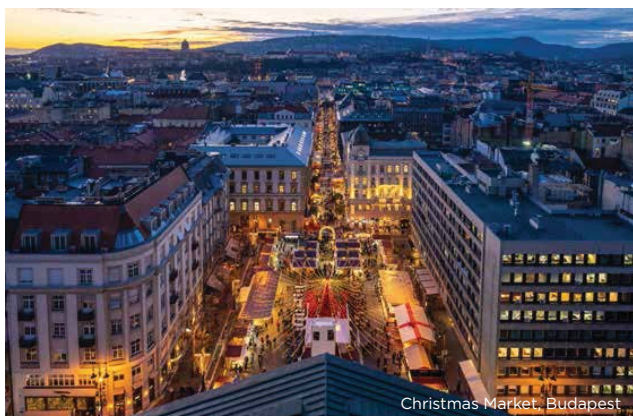
Christmas Market, Budapest

Enjoy a welcome reception dinner in the elegant surroundings of this art nouveau landmark where you can meet your fellow travellers ahead of this highly anticipated journey.