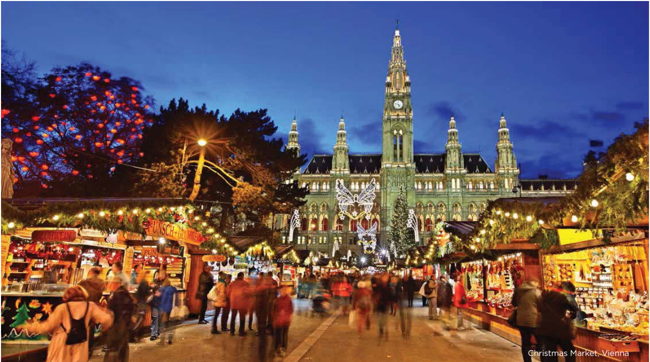
Christmas Market, Vienna