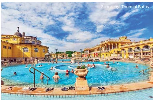
Schezenyi Thermal Baths

On arrivals day in Budapest, you will be met at the airport, train station or river ship landing stage and transferred to the Four Seasons Hotel Gresham Palace for a two-night stay. Enjoy a welcome reception dinner in the elegant surrounds of this art nouveau landmark, with its panoramic views across the River Danube, where you can meet your fellow travellers on this highly-anticipated journey.