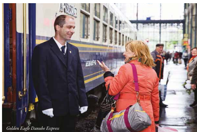
Golden Eagle Danube Express

Our full booking conditions can be found at www.gettrains.com