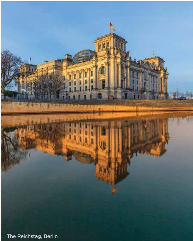
The Reichstag, Berlin

For guests not taking the driving experience option, there will be free time this afternoon with the opportunity to visit the museum of your choice such as the Topography of Terror; or take time for reflection and contemplation at the poignant Memorial to the Murdered Jews of Europe. There will also be time for shopping along the elegant Kurfürstendamm boulevard.