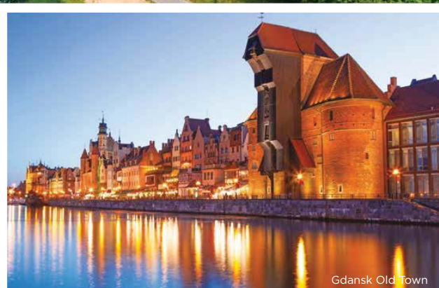
Gdansk Old Town

The coastal region of Poland has an important place in Polish consciousness as a key location at the start of World War Two in September 1939. This is also where the famous Solidarity independent trade union movement started in 1980 for the protection of worker's rights, which later became the symbol of