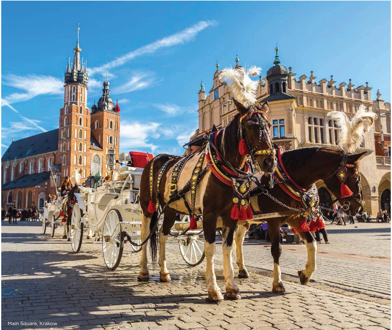
Main Square, Krakow

the beautiful Old Town Square. After lunch we will walk the streets of the Old Town including a visit to Wawel Royal Cathedral, followed by a panoramic tour of the Kazimierz Jewish district.