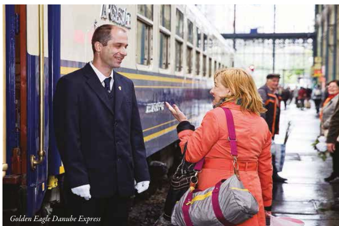
Golden Eagle Danube Express

Our full booking conditions can be found at www.gettrains.com