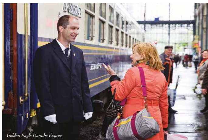
Golden Eagle Danube Express

Our full booking conditions can be found at www.gettrains.com