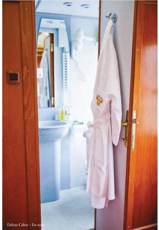
Deluxe Cabin – En-suite