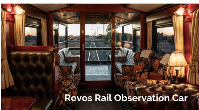
Rovos Rail Observation Car

This holiday can be amended to meet your requirements. Prices correct at time of publication. Subject to availability. Terms and conditions apply.